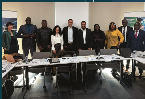
Technology Demonstration Workshop with Doktor Technologies in Türkiye with representatives from Togo, Sierra Leone and Uganda.

Through the TDCP, IsDB will continue facilitating the deployment of technologies by matching their needs with available and appropriately sized technologies that can address development challenges and enhance economic growth.