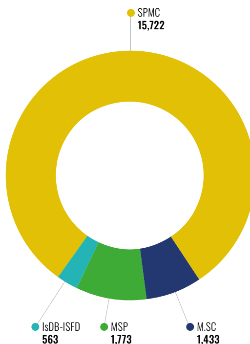
FIGURE 2.1: IsDB SCHOLARSHIP PROGRAMME BREAKDOWN SINCE INCEPTION

OVER THE PAST FOUR DECADES, THE BANK HAS OFFERED SCHOLARSHIPS TO 19,491 STUDENTS AND SCHOLARS FROM 56 MEMBER COUNTRIES AND 66 MUSLIM COMMUNITIES, WITH A MALE-TO-FEMALE RATIO OF 70% TO 30%.